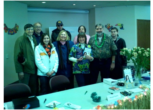
Gathering With family at the book launch